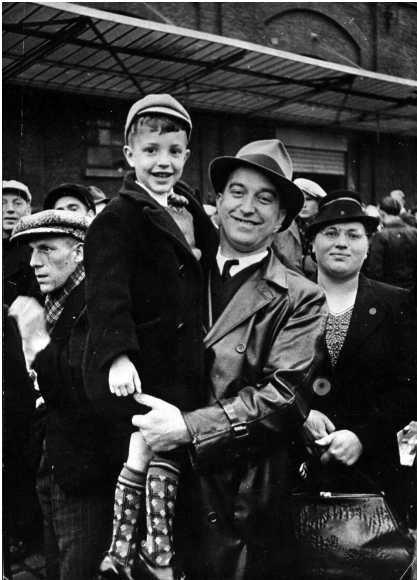
Departure of the first voluntary workers to Germany, 1940 (photo Spho). CegeSoma n°4791.

The project was launched in October 2017 and dozens of Dutch- and French-speaking families have already been interviewed.