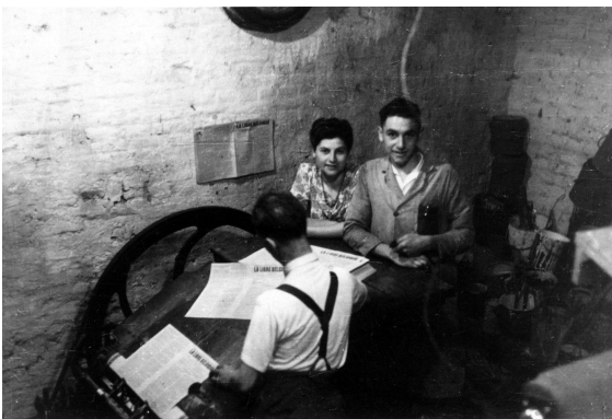
Clandestine newspaper "La Libre Belgique". Photograph taken in 1944 in the clandestine printing shop located 87, rue St. Gilles in Liège, and developed after the Liberation. Photo 27956.

Almost one year ago, on 27 September 2017, we launched the website "Belgium WWII". The aim was to make the works and research of the most renowned experts accessible to the general public in a clear and concise manner. The purpose was not to propose an official version of history, but to provide information with a quality label substantiated by the academic credit of the Study Centre War and Society and the thorough evaluation of the texts.