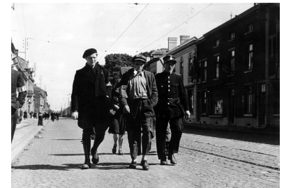
Répression et exécution de collaborateurs, 1944 – Photo A. Neufort. Coll. CegeSoma CA 553