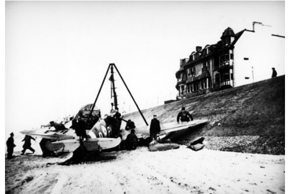
RAF Spitfire forced to make an emergency landing after an air-to-air combat, Westende, 29 August 1941.

The data sheets provided by Van Merode were listed by air force and, within these air forces, by alphabetical order according to the different types of airplanes. Our volunteer Pierre Brolet has separated each of these large collections in two parts, depending on whether or not the missions or crashes were related to Belgium. Thus, are related to Belgium the first 6 maps (out of 91) related to the RAF, the first 7 maps (out of 94) related to USAAF, the first 10 maps (out of 15) related to the Luftwaffe, as well as map 201 related to other air forces. For more details, see the inventory here .