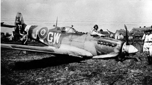
RAF Spitfire shot down in Avelgem in 1944. The presence in the picture of a woman, two children and a resistance fighter proves that the photo has been taken after the liberation of the territory.