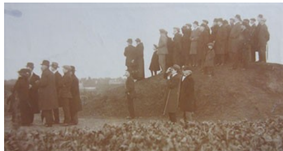
At the end of the summer of 1914, Brussels has been invaded by the Germans. Alerted by the noise of the guns, the population of Schaerbeek tries to see the fights that continue outside the town centre.

This approach of the war through photography – now considered a historical source in its own right – is original in that it proposes a totally different way of understanding daily life during this troubled period. Indeed, beyond obvious limitations, photography highlights aspects of experiences of the occupation that have often remained unexplored. These photographic trajectories transform and enrich our perception of Brussels and the Walloon cities during the war.