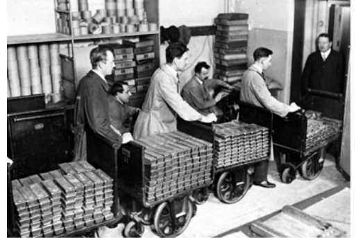
National Bank of Belgium – gold loading (32 millions BEF)