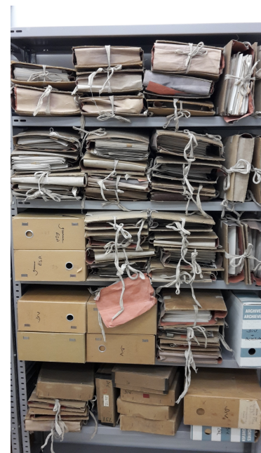
Photographs in their original maps before repackaging by CegeSoma