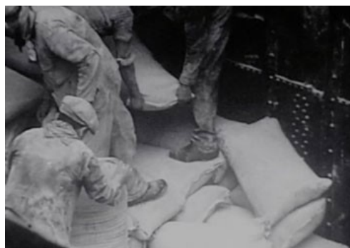
Loading of sacs of flour in a flour mill. Excerpt from a propaganda film "Où en est notre ravitaillement ?" made in 1946 by Gaston Vernailien for the department of Supply.