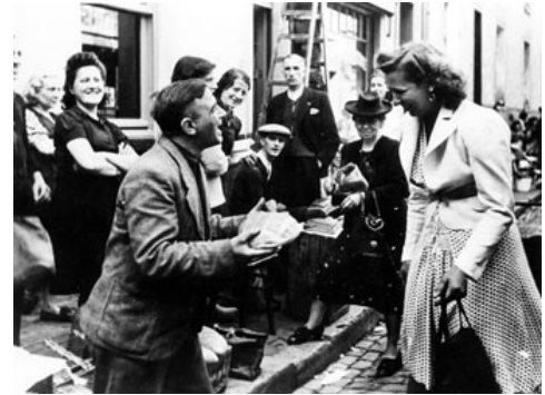
Young woman buys bread on the black market. Belgium, 1943.