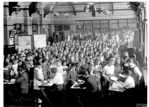
1916: London pupils pay their weekly contribution to the War Savings Association.