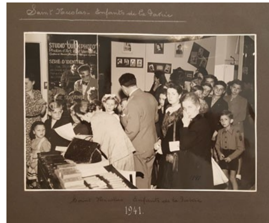
Saint Nicholas Day celebration organised by Les Enfants de la Patrie, 1941.