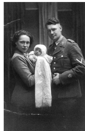
Baptism of the baby girl of a Belgian woman and a "Wehrmacht" soldier. (Photo CegeSoma, No. 262518)