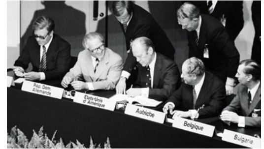
1 August 1975, signatories of the Helsinki Agreements.

In the 1980s, the International Helsinki Federation for Human Rights (IHF) was an important NGO. It acted in favour of human rights on the basis of the Helsinki Accords. Strangely, the NGO did not include a Belgian branch. This absence and its impact on the human rights question in the Belgian context will be at the core of the conference, as well as the members and the strategies implemented in favour of human rights during these years.