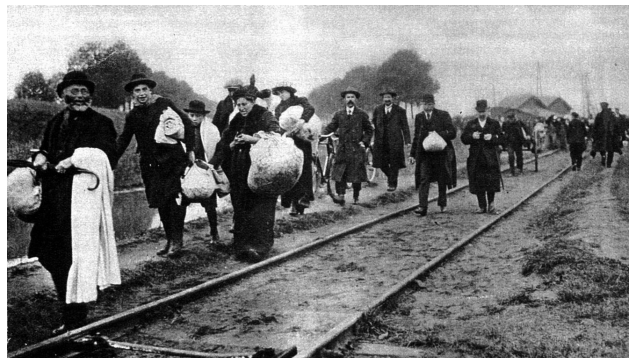
Terugkeer van de Belgische vluchtelingen uit Nederland na de val van Antwerpen. Het spoorwegverkeer was ontreederd, zodat men niet verder geraakte dan Merksem, van waaruit men dan te voet verder moest. (Foto CegeSoma, collectie Mary Deloy, nr. 56531)