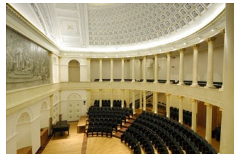
The sale académique at the Université de Liège.

Info & contact: christoph.brull@ulg.ac.be