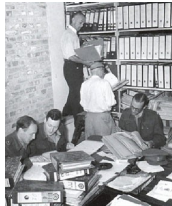
Historians tracing WWII archives in postwar Germany shortly after the war.