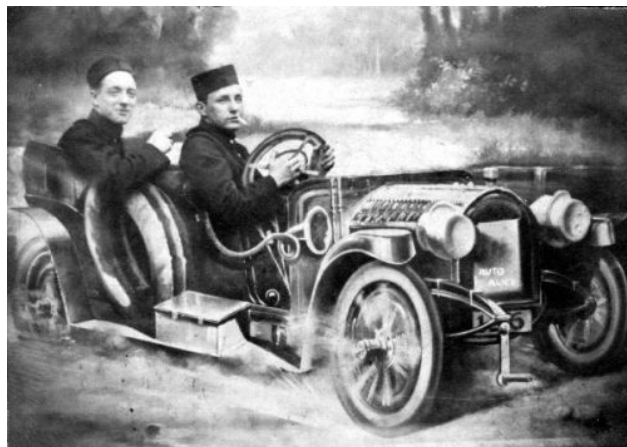
WWI Family Picture

Place: CegeSoma, Square de l'aviation 29 - 1070 Bruxelles