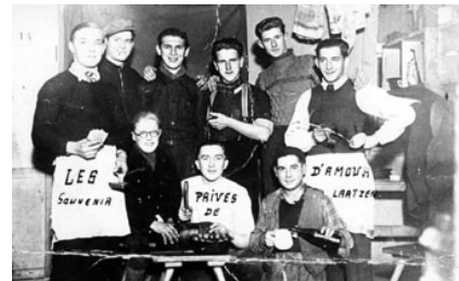
Belgian forced labourers in Germany during the Second World War. The message, "Les privés d'amour. Souvenir de Laatzén", is a strong one.