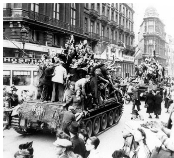
English troops in Brussels in September 1944.