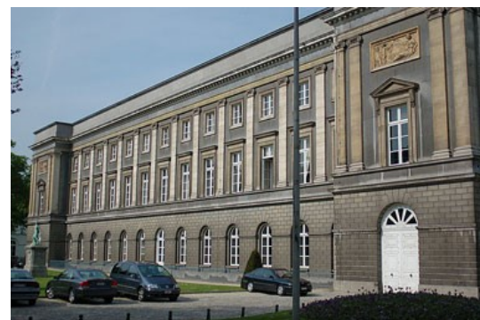
Le Palais des Académies, où la "KVAB" est hébergée.