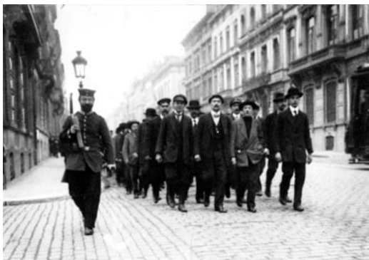
Brussels. German volunteers on their way to the station to enlist with the Imperial Army.

Some eighty (Field)diaries, notebooks, miscellaneous texts and other ego documents, manuscripts as well as typed copies, illustrate different aspects of war and occupation in Belgium. More than half of these documents are in French, which should not come as a surprise (see below).