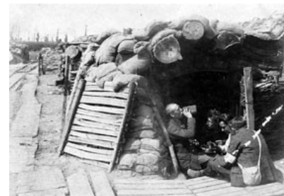
Dressing Station Line A, sector Boezinge, June 1917.