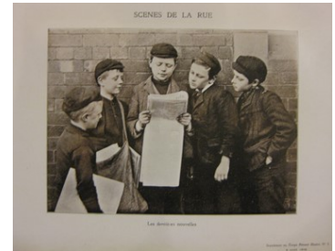
The press, information and propaganda tool in War times. Photograph from the supplement of the Brussels weekly newspaper 'Le Temps présent illustré', N°1, 4 August 1915."