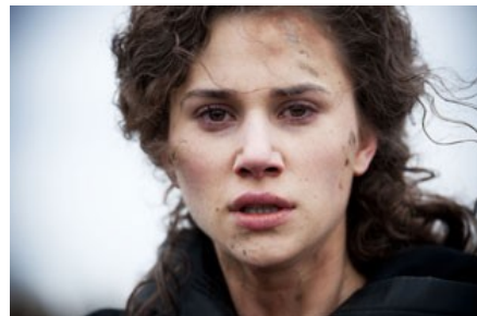
The actress Lize Feryn, who plays the role of Marie Boesman.

Participation is free, but in view of the limited number of seats, advance registration is requested via cegesoma@cegesoma.be ou 02/556.92.11.