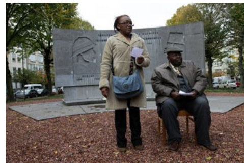
Each year, on 11 November, a commemorative ceremony takes place on place Riga in Schaerbeek in front of the monument of the veterans of the Congolese Force publique. The monument was erected in 1970 and pays special homage to the fighters involved in the capture of Tabora, a 'Belgian' feat of historical importance during the First World War. The Institut des Vétérans honours the 27 Congolese soldiers who fought at the Yser (with a publication and an itinerant exhibition), but Congo's war effort on the African front remains one of the blind spots in the commemorative programmes in Belgium.