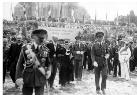
Inauguration of the Inter-Allied Memorial in Liège, in the presence of King Leopold III, 20 July 1937.